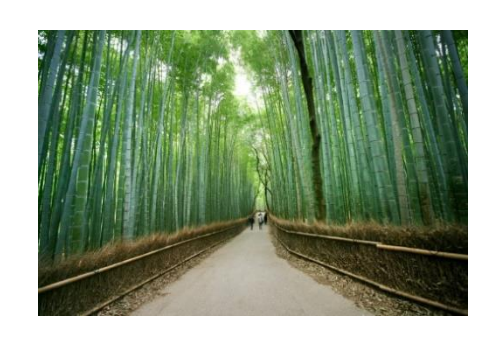
- Gion District