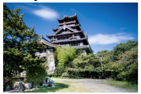
-A photo stop at the Imperial Palace Plaza