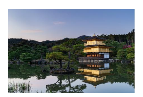
-Tea Ceremony Experience