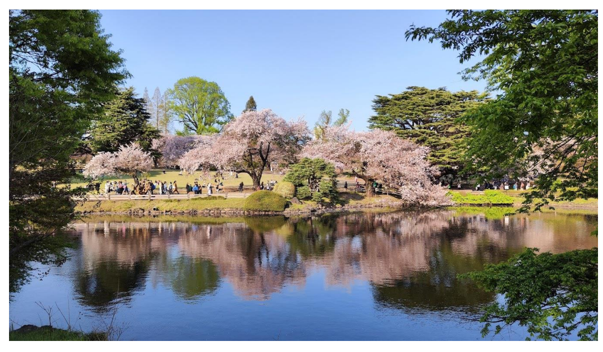
A walk thru the Public Garden Shinkuy Gyoen to enjoy the Sakura ~ the Cherry Blossoms